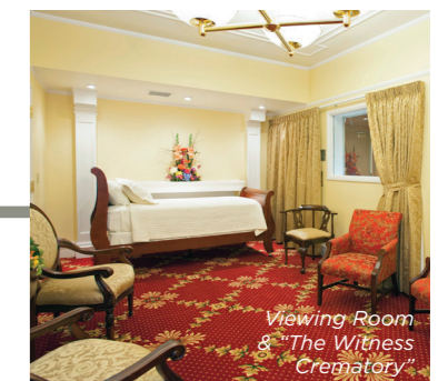
Viewing Room & "The Witness Crematory"