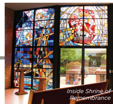
Inside Shrine of Remembrance