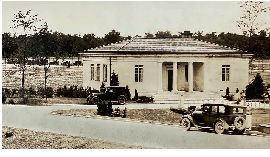
Pictured: The family service office in the formative years of Michigan Memorial Park.