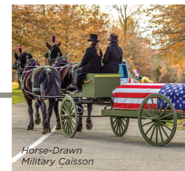
Horse-Drawn Military Caisson