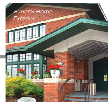
Funeral Home Exterior