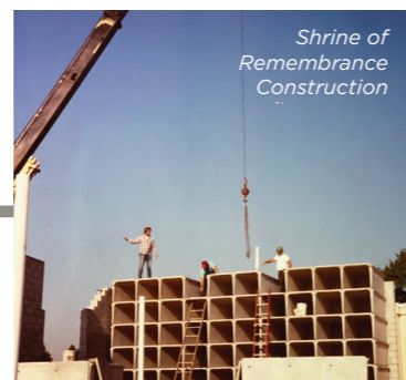
Shrine of Remembrance Construction